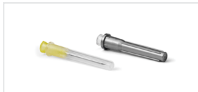
Needle or needle-less transfer device*—1 per HyQvia vial