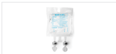
Optional: Saline infusion bag (if required by your doctor)