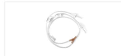
Gravity fill set with vented spike and sterile cap