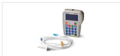
Peristaltic infusion pump, pump tubing, power supply, and manual