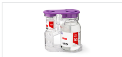
HyQvia vial(s) The number of vials you will have will depend on your prescribed dose.

It may seem a bit overwhelming at first, but this guide will walk you through the supplies you'll be using and the infusion process. Something to know – the supplies that you receive from your pharmacy may look different, and that's OK. Supplies may vary based on what brands the specialty pharmacy has in stock.