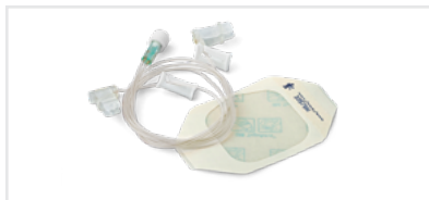
Subcutaneous needle set with a clear dressing—1 per infusion site