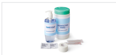
Alcohol swabs, antibacterial cleaner, soap, tape, and bandages. Gloves can be used if recommended by your doctor