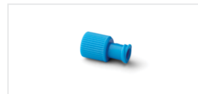
Sterile tip caps—1 per syringe